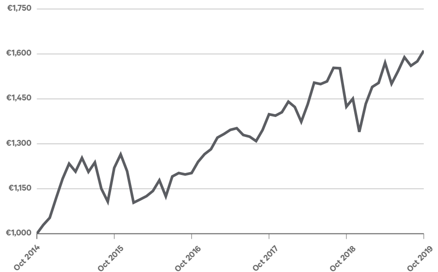
FIGURE 1: Growth of €1,000 to 31st October 2019*

Source: Irish Life Investment Managers Ltd. and Davy Asset Management.