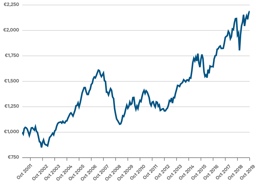
FIGURE 1: Performance for Davy Global Focus Fund to 31st October 2019

Source: Davy Asset Management and Northern Trust. Performance chart refers to Davy Global Focus Fund A Acc (€) net of fees.